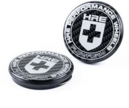
FlowForm Center Caps - Carbon Fiber