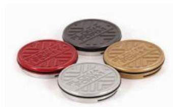
BILLET STANDARD (OPTIONAL)