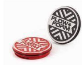
BILLET TWO TONE (OPTIONAL)